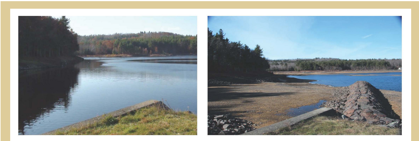
These photos compare the water level in a reservoir in Worcester, Massachusetts, with the one at the right showing the impact of the 2016 drought.